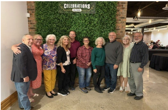
2025 Volunteer Recognition Dinner