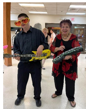
Johnson City Senior to Senior Dance

Social Isolation and Intergenerational Support – Social Isolation prevention continued to be a top priority in 2025. BCOFA partnered with several Binghamton University Departments to provide internship opportunities. In 2025, interns made 315 home visits to 37 older adults in their homes to engage in conversations and various activities. Older adults reported enjoying their regular home visits and students served as “eyes in the home” for OFA staff. Interns also provided support with intergenerational board games at local senior centers and the Walk with Ease program at the Oakdale Commons. Two intergenerational dance events were held in 2025 at Broome West and Johnson City Senior centers. Both were supported by students from the UE and JC High school.