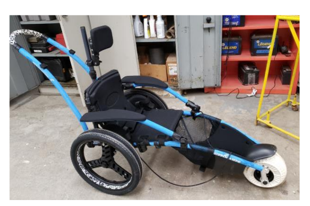
All-terrain beach chair is available at Dorchester park

reconstructions projects etc. At Dorchester Park an accessible boat launch and all-terrain beach wheelchair were added. In 2023, a new survey was distributed to learn about the 55+ population and their needs. A new three-year Action Plan covering the 2024 - 2027 is being reviewed and will be submitted to AARP in 2024. We look forward to collaborating with local partners on making continuous age-friendly improvements in Broome County that help people of all ages.