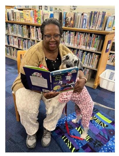
Foster Grandparent Volunteer at the Broome County Library

In Home Services Program (IHSU) - The Guaranteed Aide Program was renewed by OFA which provides 30 hours of aide service directly to clients being served by OFA's In-Home Services Unit. It was important to continue to support the Guaranteed Aide initiative since there continues to be a shortage of aides throughout the county and state. The Guaranteed Aide model allows OFA to provide a higher rate of pay, mileage reimbursement and time off to the aide assigned to OFA cases. This initiative was supported by unmet needs funding issued by the New York State Office for Aging. With this new initiative, OFA reduced the waitlist for some clients needing service. The Guaranteed Aide also promoted service in rural underserved communities.