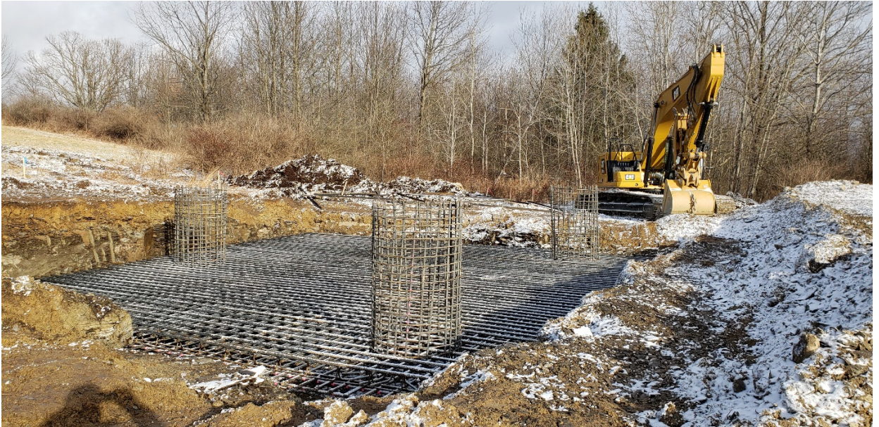
Nabinger Hill – Rebar for tower foundation.