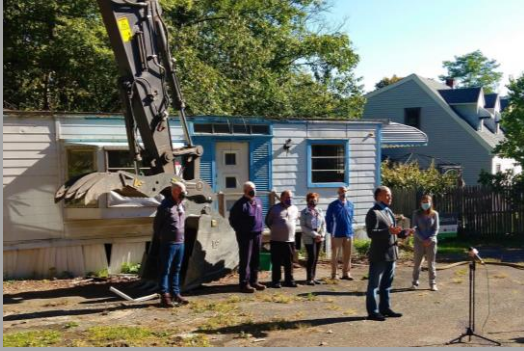
7 East Maine Rd., Town of Union pre-demolition press conference with County, Town and Land Bank Officials

Working with Broome County and the Town of Union, properties identified were 7 East Maine Road and 149 Endwell Street. 149 Endwell Street was a blighted structure affected by both the 2006 and 2011 floods. The property had been a recipient of numerous code violations. 7 East Maine Road consisted of several vacant mobile homes. The property is located in between a busy road in the Town and a large creek. Prior to demolition, the BCLBC's Term Contractor, Delta Engineers, determined that the current placement of each mobile home was unsound due to the overhang on the creek. Town of Union Code Enforcement was able to verify that each structure