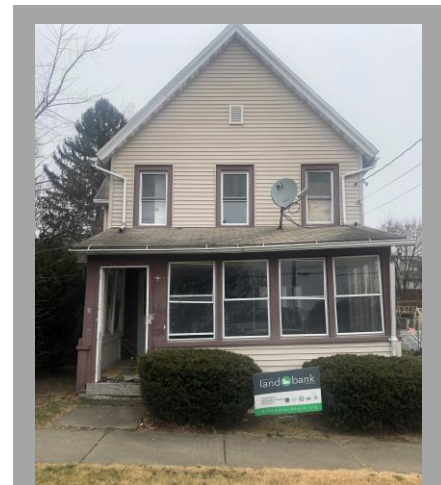
124 Gaylord St., City of Binghamton

demolition projects throughout Broome County. The BCLBC collaborated with local elected officials to identify the following four properties: 1944 North Road and 2300 Owego Road in the Town of Vestal, 108 Roosevelt Avenue in the Village of Endicott and 22 Fuller Street in