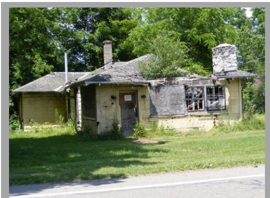
2300 Owego Rd., Town of Vestal

The BCLBC has developed a strong working relationship with Broome County, particularly when identifying foreclosed properties to acquire for demolition and rehabilitation. Detailed previously, the Land Bank successfully acquired three residential properties in the City of Binghamton in 2020 as part of CRI Round 4 for the purpose of rehabilitation for resale to buyers who meet affordable standards not exceeding 80% of Area Median Income. Construction will commence in the beginning of March 2021. The