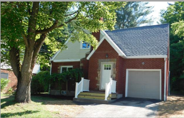
1125 Glenwood Rd., Town of Vestal

support all rehabilitation projects in the BCLBC's CRI Round 4 grant deliverables. In addition to the completion of 32 Hayes Street and 76 Park Avenue, the BCLBC acquired 33 Linden Street, 124 Gaylord Street and 15 Birch Street to rehabilitate in 2021. Each property ranges in complexity and is a challenge that the Land Bank Executive Director and Board are excited to undertake. The estimated combined development costs for the remaining three properties is $675,000 and the sales to qualified families should take place prior to the end of 2021.