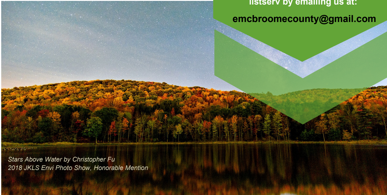
Stars Above Water by Christopher Fu 2018 JKLS Envi Photo Show, Honorable Mention

Topics include natural resource management, water resource protection, land use planning, sustainable development, clean energy and solid and hazardous waste management.