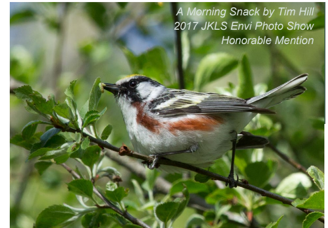
A Morning Snack by Tim Hill 2017 JKLS Envi Photo Show Honorable Mention