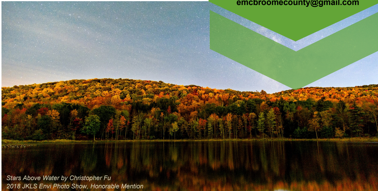
Stars Above Water by Christopher Fu 2018 JKLS Envi Photo Show, Honorable Mention

Topics include natural resource management, water resource protection, land use planning, sustainable development, clean energy and solid and hazardous waste management.