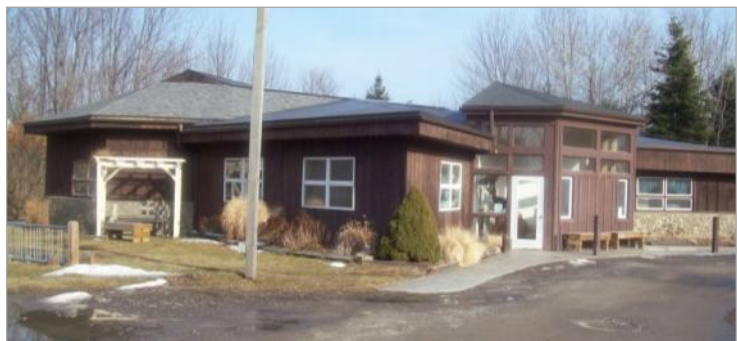
The Waterman Center is an educational, interpretive, and recreation facility in the Town of Owego.

Hiawatha Island is located in the center of the Susquehanna River across from the Town's Hickories