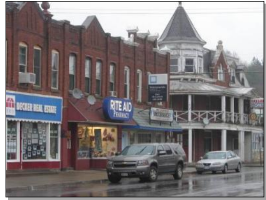
Like other small villages in the Heritage Area, Whitney Point should focus on attracting new small businesses to its downtown.

Like Lisle, Whitney Point is located in proximity to a busy regional road network. Unlike Lisle, Whitney Point's commercial center is comprised largely of buildings of brick construction, a result of the fire, giving the small village an urban feel. The Main Street business district is located off of the busy roads reducing the negative impacts of traffic. Whitney Point represents the diversity of villages within the Heritage Area; it is similar to Owego and Waverly in character and has strong potential for the adaptive reuse of its historic buildings. Some buildings, however, have been inappropriately treated, diminishing their historic character. Design guidelines and creative marketing could turn Whitney Point into a small commercial center.