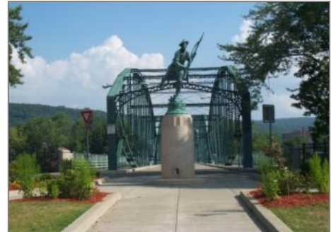
Historic South Washington Street bridge in the City of Binghamton.

Aggressive revitalization measures have been undertaken in Binghamton over the past forty years to revitalize downtown in the face of declining industries and the loss of jobs. These efforts have had mixed results but have been important to the future of the City and efforts should be continued. The Urban Cultural Parks Program that is the predecessor to the Heritage Area Program focused largely upon urban Binghamton. Historic buildings and districts were