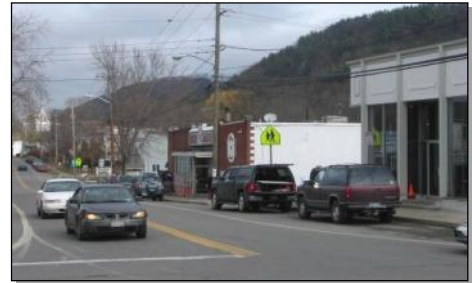
Image of commercial area in Village of Spencer.

Established in 1886, the Village of Spencer occupies a crossroads within an agricultural valley. It has a small downtown area with a handful of historic Italianate-style brick commercial buildings as well as a few newer business properties. The architecture of the village homes, churches, and businesses is predominantly late nineteenth – early twentieth century, with a few earlier residential examples.