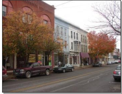
The Village of Waverly boasts a business district with a strong architectural presence and significant opportunities for revitalization.

Waverly has the same kind of small town appeal as Owego, but has not been as successful in implementing revitalization programs. Two and three story historic brick buildings along the Village's primary commercial street are appropriate for revitalization and adaptive reuse, with pleasant and prosperous residential neighborhoods located within walking distance of downtown. A comprehensive revitalization program, similar in design to that which was implemented in Owego, is recommended. A potential partner to further revitalization of the Village in tandem with the Heritage Area could be the Waverly Business Association.