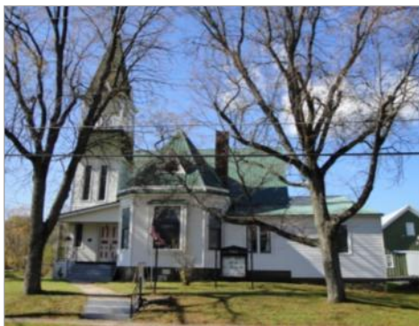
Berkshire United Method Church is an extant structure in the Town dating to 1889.

The Town of Berkshire in Tioga County is named after Berkshire County in Massachusetts and was originally known as “Browns Settlement.” The town was established in 1808 from the Town of Union and became part of Tioga County in 1822. The Town of Berkshire is located immediately north of Newark Valley. Like Newark Valley, the town’s western boundary is along the West Branch of Owego Creek, and the town is bisected by scenic State Route 38, which serves as a proposed heritage corridor. The town has a significant number of historic buildings and sites which are recognized by designation on the National Register of Historic Places, as well as the designation of the Berkshire National Register Historic District.