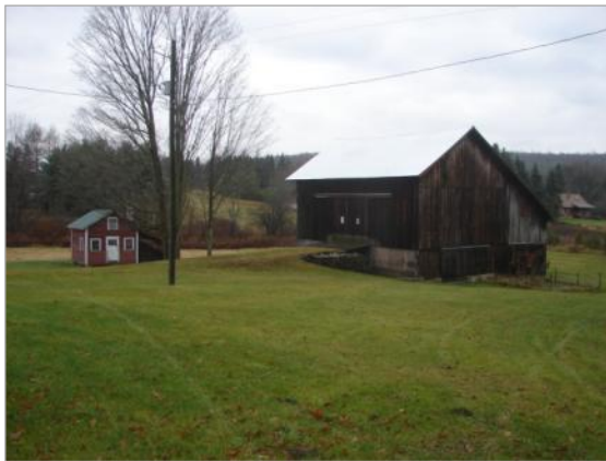
Existing farmstead located on Route 21 in the Town of Maine.

The Town of Maine was settled in 1794 but was not fully incorporated until 1848 when it separated from the Town of Union. Maine is located north of Union and east of Newark Valley. The town grew to a highpoint through the mid 1800's as an agriculturally based community. That early growth was followed by a steady decline through the early 1900's. The population of