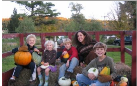
Sunny Hill Farm is one of the agritourism businesses located in the Town of Nanticoke.

The Town of Nanticoke is located on the western boundary of Broome County, north of the Town of Maine. The Nanticoke-Maine valley was originally settled by the Nanticoke Indian tribe in the late eighteenth century. Today's town boundaries were officially established in 1831. The population of the town grew into the late 1800's when it prospered with the presence of a strong farming industry and commercial and industrial sectors, including flour and lumber mills. By the mid twentieth century, the population of the town declined due to job losses associated with over-lumbering, changing technology, and increased competition from surrounding communities.