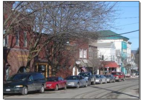
Image of the Deposit central business district shows an active streetscape with cars parked on the street. Appropriate façade treatments should be encouraged.

Deposit is located in a remote location at the far eastern edge of the Heritage Area and is laid out in a grid plan with a well-developed historic downtown core of commercial buildings along Front Street. Churches, a school, a library, an historic theatre, and numerous historic homes border the commercial zone. Its well-defined main street has a number of historic buildings. However, many of the buildings have been treated inappropriately, diminishing their historic character. Residential areas adjacent to the commercial center are quite charming, and a number of historic residences have been appropriately rehabilitated. The Heritage Area should support local efforts to improve the character of the downtown corridor and create a stronger connection to the geographic core of the Heritage Area through interpretation and story-telling.