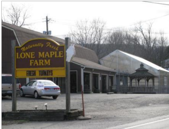
Lone Maple Farm is one of the many agritourism businesses located within the Town of Binghamton.

The Town of Binghamton is located in south-central Broome County. The northern portion of the town includes the confluence of the Susquehanna and Chenango Rivers and the City of Binghamton. In 1786 William Bingham bought more than 32,000 acres of land in this area,