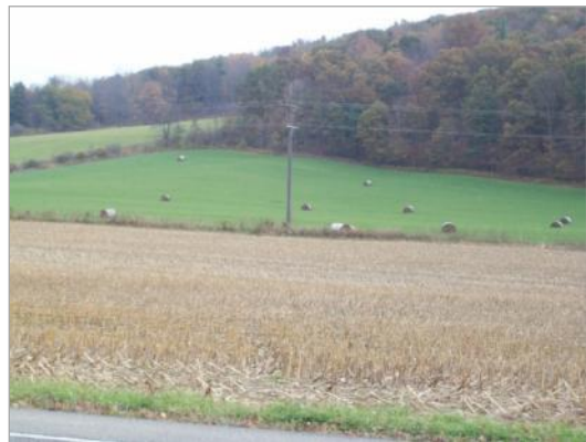
The scenic landscape in the Town of Spencer is similar to other outlying, rural areas in Tioga County.

The Town of Spencer was organized in 1806 from the Town of Tioga. Historically, and today, the Town consists largely of agricultural and undeveloped lands and has a strong relationship to the City of Ithaca and Cornell University to the west. The Town is characterized by the broad valleys along the Route 34 and 96 corridors. Spencer lies at the juncture of these valleys, which have some of the most significant farmlands within the region. In addition to the incorporated Village of Spencer, a number of distinguishable hamlets are located within the Town including Cowells Corners, Crum Town, North Spencer, and West Candor.