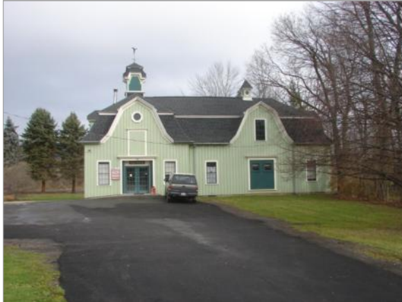
Image of the Nichols Town Hall.

The Town of Nichols, established in 1824 from part of the Town of Tioga, is located west of Owego and south of the Susquehanna River along the New York-Pennsylvania border. The Town includes the incorporated Village of Nichols, as well as the hamlets of Briggs Hollow, Hoopers Valley, Litchfield, and Lounsberry. 8 Historically, and continuing through the present,