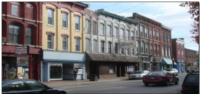
Image of the streetscape in downtown Owego that includes a successful mix of retail, restaurants, and small businesses.

The Village of Owego was founded in 1787 and is situated on the Susquehanna River at the western edge of the Town of Owego. The completion of the Owego-Ithaca Road in 1808 and the presence of a ferry crossing and later a bridge across the Susquehanna made Owego a prosperous trade center during the nineteenth century. Later, manufacturing and industry created more wealth,