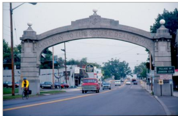
The Endicott-Johnson Arch is a prominent gateway in the Village of Johnson City, representing the history of the community and legacy of the Endicott-Johnson Company.

In a quest for reformed labor practices and quality of life, the company provided its Johnson City employees with community amenities, such as parks, swimming pools, and a merry-go-round (carousel). Your Home Library offered classes and places for residents to socialize. Suburban-style company-built housing developments also developed. These neighborhoods contained blocks of similar sized homes built in popular styles of the day