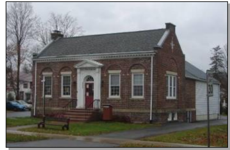
The Colonial Revival library is an important historic structure in downtown Lisle.

Lisle's location along State Route 79 to Ithaca and near State Route 11 and Interstate 81 suggest that the Village could be revitalized with appropriate commercial uses. A series of wood framed historic commercial buildings are located in the center of the Village and have strong potential for adaptive reuse. These buildings should be the focus of a community-based revitalization effort. Appropriate uses must be found that will take advantage of the customer base along the busy roadway as Lisle has the framework in place to be a strong historic commercial village.