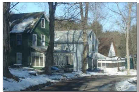
The Village of Deposit has a number of historic residential neighborhoods.