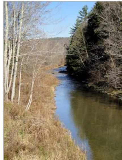
A meandering creek in the Town of Barker exemplifies the natural beauty and resources of the Heritage Area.

The Town of Barker is one of the oldest communities in Broome County, established on April 18, 1831. Historically, the town has been a small agriculture-based community. As in many rural communities, the mid-twentieth century saw unprecedented levels of growth due to rapid suburbanization and an influx of urban dwellers interested in residing in attractive, rural communities. The town is characterized by rolling hills, a narrow river, and a stream valley with few suburban style residential developments. Many of the rural attributes and agribusinesses in the town