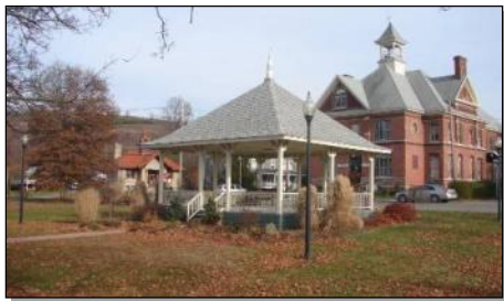
The core of Newark Valley includes the renovated free academy and public gathering space across from town hall.

The Village has a linear layout with a large park square surrounding the village green and bandstand at the center. At the top is a magnificent brick former free academy that now serves as a post office and town hall. The tiny Renaissance Revival Tappan Spaulding Memorial Library also stands nearby. The main street is lined with an array of historic frame commercial buildings, churches, and homes. An industrial area is sited near the bridge at the north end of the town center and a number of high-style residences are intact at both ends of the Village.