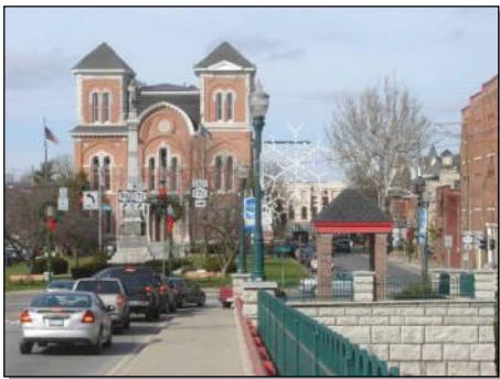
View from bridge to downtown public activity area and the gateway to the Historic Owego Marketplace.

Owego is the local model of success that can be achieved through a comprehensive and sustained downtown revitalization program. The Village core and surrounding neighborhoods are appealing in character. The adaptive reuse of historic buildings along several commercial streets has created a lively commercial area with a number of fine shops and restaurants. To an extent, the task of revitalization was easier in Owego than in the Triple Cities because of its smaller size and balance of commercial, manufacturing, and residential neighborhoods.