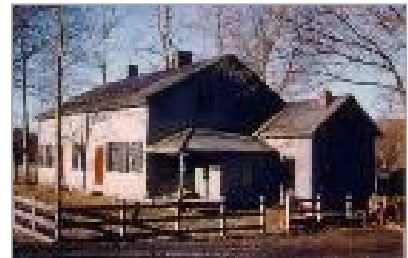
Image of Bement Billings Farmstead in the Town of Newark Valley.

Historic sites have been a source of visitation to the town, most notably to Bement Billings Farmstead. There is a significant concentration of historic resources, including National Register listed sites and buildings, throughout the town and along the State Route 38 corridor. State Route 38 is an important north-south connector within the Heritage Area linking the Village of Owego to the south to the Villages of Newark Valley and Lisle to the north.