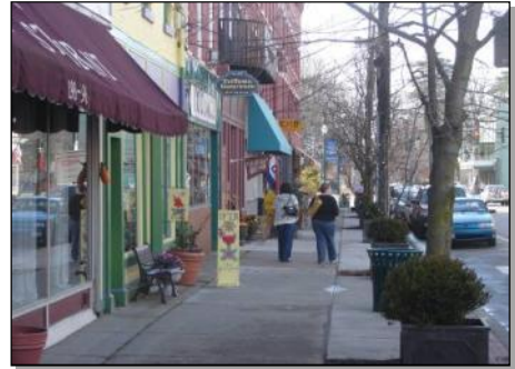
The Village of Owego boasts distinctive streetscapes that include landscaping, pedestrian amenities, and sidewalk signage.

In the fall of 1849, much of Owego's business district was destroyed by a fire in which 104 buildings were lost. Between 1850 and 1890, the downtown area was rebuilt with new brick buildings, and the commercial district today reflects this construction period. Today, Owego is the second largest village in Tioga County and serves as the county seat. The Village Courthouse Square, with the 1872 Courthouse and county buildings bordering a sloping green and facing the river, forms an impressive gateway to the town center. Owego's streets are lined with an impressive array of residences, public buildings, and churches, including numerous high-end examples of the most popular architectural styles of the nineteenth century.