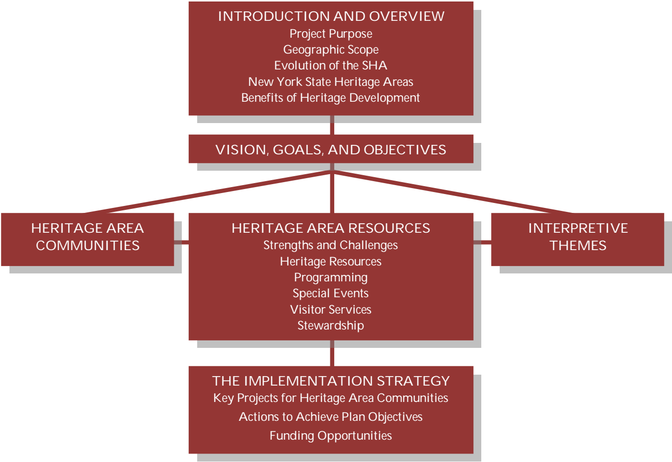
Figure 1: General Organization of the Susquehanna Heritage Area Management Plan

The general organization of the Susquehanna Heritage Area Management Plan Amendment is presented below: