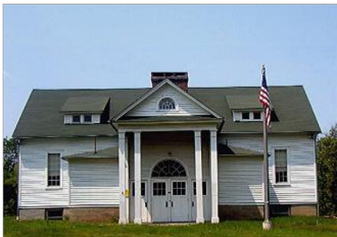
The Kirkwood Schoolhouse is an important local historic resource and is home to the Kirkwood Historical Society.