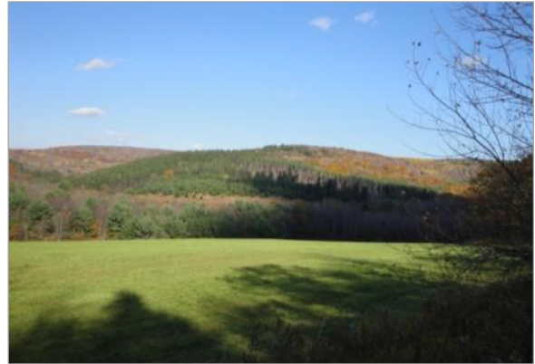
Image from Richford looking toward Michigan Hill and Griggs Gulf State Forests exemplifies the rural, scenic beauty of the Heritage Area.

The Town of Richford is centered near the intersection of State Routes 38 and 79 in northern Tioga County and provides an important connection between Heritage Area communities in Tioga and Broome Counties. Approximately one-fifth of the land area in the town is identified as part of a state forest. With the strong state forest presence and some of the highest elevations in Tioga County, Richford is notable for both its rural landscape and its recreational opportunities. The town is also recognized as the birthplace of John D. Rockefeller. 9