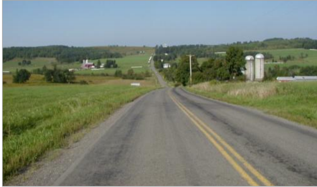
A view of one of the proposed “Local Heritage Byways” through the Town of Triangle.

The Town of Triangle was originally known as the “Chenango Triangle” because of the triangular shaped formed by its location at the confluence of the Tioughnioga and Otselic Rivers. The Town was officially formed in 1831 and includes the Village of Whitney Point and