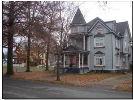
The Village of Waverly also has an abundance of historic residential neighborhoods lined with high-style examples of residential architecture, such as Queen Anne.