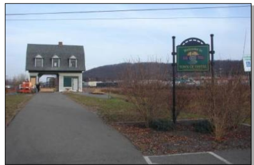
A historic structure serves as the gateway to the successful Rails to Trails project in the Town of Vestal.

The Town of Vestal, located along the Susquehanna River to the south of Union, was established in 1823 and remained largely rural and agricultural for its first century with a small number of industrial mills. A primary commercial hub of the town formed along Front Street, and five hamlets developed: Ross Corners, Tracy Creek, Vestal Center, Willow Point, and Twin Orchards. The primary settlement of Vestal and the hamlets had stores, churches, mills, and concentrated clusters of residents.