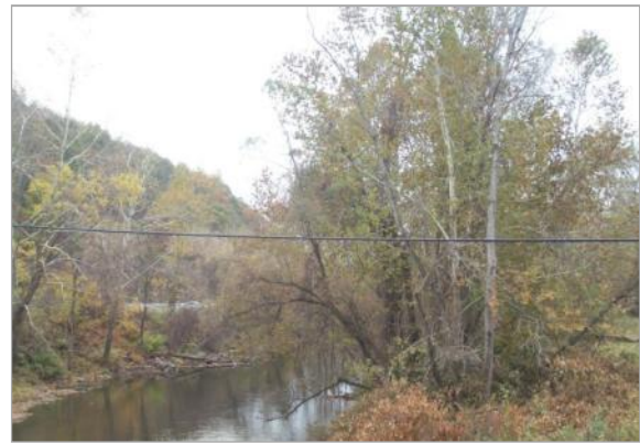
Image of creek in the Town of Tioga is representative of the valuable natural and scenic resources within the Susquehanna Heritage Area.

The Town of Tioga is centrally located in Tioga County with the Susquehanna River forming its southern border. The primary industry in the Town has historically been agriculture and the Town remains a strong farming community today. Tioga's scenic character is among its most valuable assets, both along the river and in the hills and narrow valleys north of the river. Many of the hilltops are wooded. The Town of Tioga includes several distinct hamlets, including Tioga Center, Smithboro, Halsey Valley, and Straits Corners. Tioga Center is the most developed of the hamlet areas along State Route 17C. The Tioga Centre General Store, on State Route 17C, is reminiscent of the earlier town and now specializes in antiques and collectibles. 7 The town, and particularly State Routes 17 and 17C, provide a strong linkage between the Villages of Owego and Waverly and offer scenic views of the River and natural landscapes of the region.