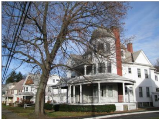
View of Chenango Street in the Village of Port Dickinson.

The Village of Port Dickinson was incorporated in 1876 and became an important port on the Chenango Canal. Today, the Village is still situated along major transportation corridors, including the beginning of Interstate 88 and the end of State Route 7. The Village has a potential National Register District and is located along the historic canal route. Heavily developed, the Heritage Area should support the efforts of the Village in recognizing and protecting their remaining historical assets and landscape resources.