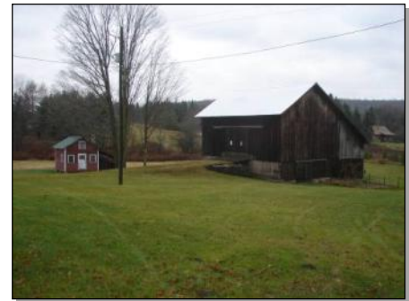
The Hamlet of Maine should build upon its historical character and rural assets.