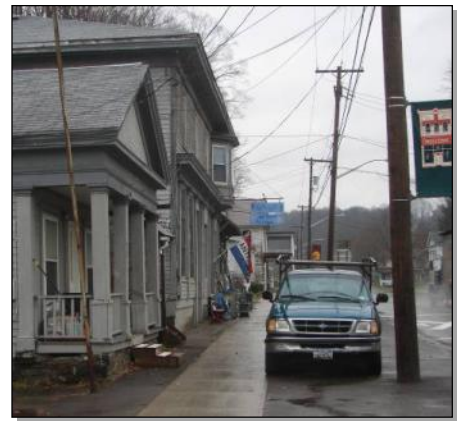
Revitalization efforts in Lisle should focus on the adaptive reuse of existing commercial buildings on State Route 79.