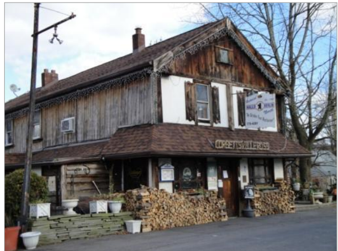
An extant commercial structure in the Hamlet of Corbettsville showcases the history still present in the Town of Conklin.

The Town of Conklin forms part of the southern boundary of Broome County and was first settled in 1788 and officially established in 1824. The Town of Conklin includes a number of unincorporated hamlets, including Corbettsville, Conklin, Conklin Forks, Conklin Station, and Conklin Center. Conklin is located west of Windsor, with the Susquehanna River running south-to-north through the town. The river is the primary geographic feature within the town, with significant roads and development along the river valley. The physical characteristics of the town have historically been impacted, most recently in 2006, by massive flooding. The 2006 flood isolated the center of the town and resulted in tens of millions of dollars in damages to homes and businesses. 15 State Route 17 runs through the northern portion of the town.