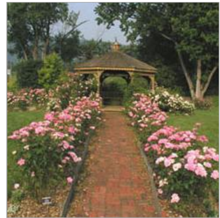
Cutler Botanic Garden is a heritage-area recognized destination in the Town of Dickinson.

The Town of Dickinson is located in Broome County north of the City of Binghamton and was established in 1890. The former Chenango Canal passed through the Town with the Village of Port Dickinson serving as a key port within the Town. Today, the Town is a suburban community of the City of Binghamton and is home to heritage resources including Cutler Botanic Garden and the regionally significant Otsiningo Park. The Town is heavily developed along the river and is bisected by Interstate Routes 81 and 88.