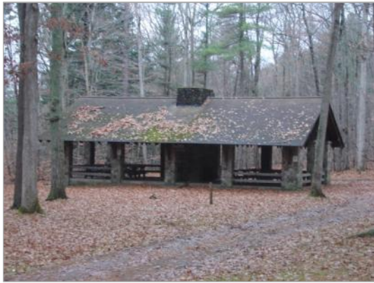
Chenango Valley State Park is a significant historical destination and attraction within the Susquehanna Heritage Area.

The presence of Chenango Valley State Park has a positive impact on the community and is a significant asset for local residents, both from a recreational and historical perspective. The park is key interpretive resource within the Heritage Area. The town has taken important steps to