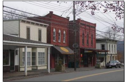
The Windsor business district does have a variety of small businesses, including a chain fast food restaurant that has been retrofitted into an existing historic commercial building.

Windsor's main street, part of a very intact National Register district, now boasts over a dozen historic frame or brick commercial buildings and former factories. Two former hotels and a town hall contribute to a well-defined downtown core. Slate sidewalks line the street.