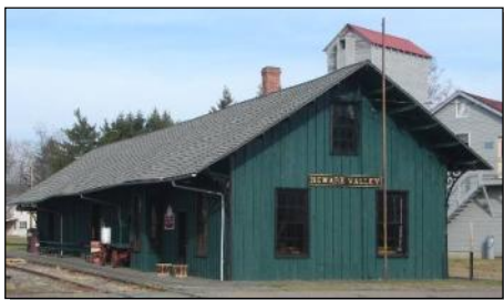
An active Newark Valley Historical Society manages the activities of the Newark Valley Depot.

Newark Valley is a charming crossroads village, and its residents take pride in its historic character as evidenced in the historic railroad station that has been rehabilitated by the Newark Valley Historical Society. A small number of historic commercial buildings along County Route 38 have the potential to provide high quality adaptive reuse projects provided the right uses are found and market conditions can be improved.