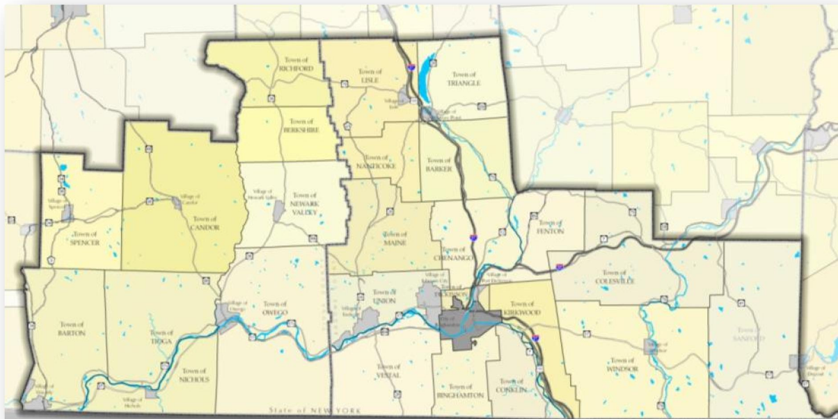
Figure 2: Proposed Susquehanna Heritage Area Boundary – Broome and Tioga Counties

Originally developed as part of the NYS Urban Cultural Parks (UCP) program, the boundary of the Susquehanna Heritage Area included specific designated historic districts within the City of Binghamton, Village of Johnson City, and Village of Endicott. This boundary was consistent with the conceptual framework of the original program which focused primarily on documenting and protecting historic sites, buildings, and resources in more urbanized areas of the state and did not intentionally promote a broader, regional framework. A series of maps showing the Urban Cultural Park boundaries as revised in 1996 are included in Appendix 3.