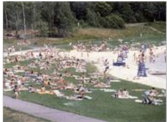
Nathaniel Cole Park is an established and popular recreation site in Broome County.

The Town of Colesville is a rural community located on the eastern end of Broome County. The town has become a bedroom community for nearby Binghamton and has experienced growth associated with its proximity to the city and its easy access to Interstate 88. The Town of Colesville is bisected by the upper Susquehanna River and State Route 79 which serves as an important scenic connection through Broome County, affording scenic views and linking Heritage Area resource areas. Colesville is home to Nathaniel Cole Park, a county park offering recreational opportunities, a number of agritourism businesses, and Harpursville United Methodist Church, a historic building listed on the National Register of Historic Places.