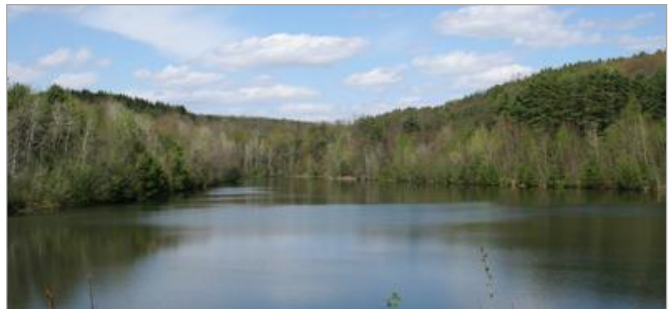
Image of Two Rivers State Park shows the southern pond that is known for its excellent kayaking conditions.

The Town of Barton is located in the southwest corner of Tioga County and borders the Susquehanna River, Pennsylvania, and Chemung County. The Village of Waverly is located in the southwestern corner of the town at the confluence of the Chemung and Susquehanna Rivers. Waverly is the center of development within the town with outlying areas retaining their rural character and agricultural industries. Historic Waverly, the scenic landscapes of the town, the presence of Two Rivers State Park, and the State Route 34 linkage between Waverly and Spencer justify the inclusion of the town within the proposed Heritage Area.