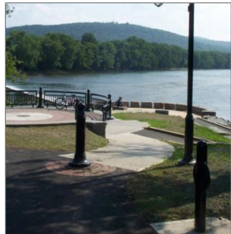
Confluence Park is an existing open space asset in the City that highlights the Chenango and Susquehanna Rivers. There are opportunities for enhancements and interpretation within the Park.