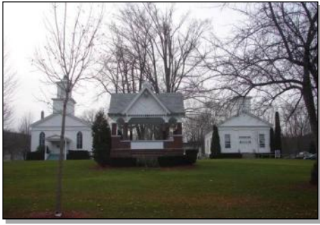
The Village green is a centralizing feature with an historic bandstand and two clapboard churches that overlook the Village.

Windsor has taken significant steps to preserve its historic character and to use that character for community revitalization. As Owego is a model for larger villages, Windsor should be considered a model for the revitalization of the Heritage Area's small, historic villages. Support, assistance, and incentives should be provided to ensure Windsor's continued success. The Windsor Partnership Association could be a local organization that helps to facilitate efforts through the Heritage Area program.