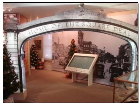
The Endicott Visitor Center is the center of interpretation and information dissemination for the Heritage Area within the Village of Endicott. The Visitor Center and attached Community Meeting Hall are housed in an historic structure known as "Old Colonial Hall."