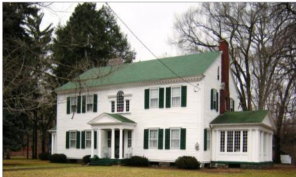
Washingtonian Hall is a prominent historic resource in the Town of Union.

The Town of Union is located along the northern bank of the Susquehanna River just west of the City of Binghamton. It includes the villages of Johnson City and Endicott and the surrounding western suburbs of the city. In addition to the villages, Union is also home to the hamlet of Endwell. The Town of Union was established in 1791 and was originally located in Tioga County. When Broome County was formed, Union became known as the “mother town” of the county. During the Revolutionary War, Union was the location where patriot forces under Generals Sullivan and Clinton met in their campaign to remove the Iroquois presence in the region and prevent further raids upon patriot settlements. The Town derives its name from this meeting. Following the Revolution, Union was opened to settlement and experienced a period of growth between 1800 and 1850 with the development of grist mills along streams and an expanding lumber and timber industry.