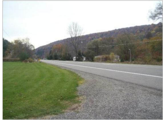
View along Route 96 in the Town of Candor showcases scenic linkages between Heritage Area nodes.

The Town of Candor, located in north-central Tioga County, has historically been an agricultural community. The Village of Candor is the primary center of activity in the town, though there are a number of distinct hamlets including Catatonk, Willseyville, Weltonville, Fairfield, and Gridleyville. 16 Route 96 is a major north-south roadway linking Owego to Ithaca with significant roadside development. Much of this development supports agribusiness within the region. Agritourism resources in the town are plentiful and serve as visitor attractions, particularly through the fall harvest season. Iron Kettle Farm on Route 96, Fallow Hollow Deer Farm, and Side Hill Acres Goat Farm are exemplary examples of the unique agricultural industries present in the proposed Heritage Area boundary.