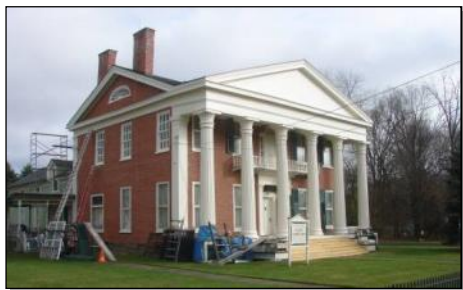
Historic building renovations are currently underway in the Village of Nichols.

The Village of Nichols is located south of the Susquehanna River in the Town of Nichols. The town was settled beginning in the 1790s and incorporated in 1824. Situated at the crossroads of River Road and County Route 282, the village developed during the nineteenth century as a busy shipping point. A bridge was constructed across the Susquehanna in 1831 and the arrival of the Erie Railroad across the river made Nichols a prime location to accumulate lumber and agricultural products from the surrounding area. The Village got its own railroad depot