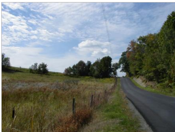
Winding rural roadways, scenic viewsheds, and farmland are defining features of the landscape in the Town of Lisle.

The Town of Lisle was first settled by Europeans in the 1790's and officially became incorporated in 1800 at which time it included the land area of the present day towns of Lisle, Triangle, Barker, and Nanticoke. In 1831 each of the Towns were separated forming their current boundaries. The early economy of Lisle relied on logging and timber which was supported by an active saw mill industry within the town. Tanneries were also active in Lisle until the 1920's. Other small industries also supported a diverse local economy, including gristmills, creameries, blacksmiths, doctors, lawyers, and grocers. The stories of these early industries and their legacies are significant Heritage Area themes. Today, the Town of Lisle is home to the historic Village of Lisle, various agritourism resources, and the State Route 79 scenic corridor. Lisle is a significant gateway to the Heritage Area, with the Route 11 and Interstate 81 corridor providing access from the north and as the first developed portion of Route 79 providing access from Ithaca to the west.