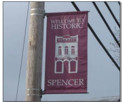
Banners reflect local pride in the history of the Village of Spencer.

Spencer's historic buildings are spread out and lack a strong central core. However, it is apparent to visitors that the Village takes pride in its historic character as evidenced by street banners and brochures. A number of significant buildings have been appropriately rehabilitated. Spencer is the location of the Frisbie Homestead, a local museum with hands-on exhibits for children, and the museum and archive of the Spencer Historical Society. The Heritage Area should support the Village and work with existing Heritage Area sites and organizations to further revitalization efforts.