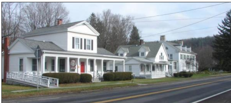
High-quality historic structures remain largely intact through the center of Candor.

The Village of Candor is the central settlement within the rural Town of Candor. It was established in 1794 and developed into a crossroads community with a small downtown core of brick and frame commercial buildings constructed during the 1800s and early 1900s. Numerous houses and a church of the same period surround the core to make up the remainder of the village.