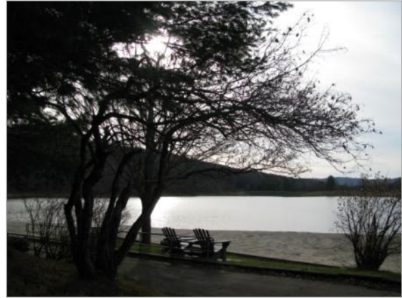
Sunset image from Oquaga Creek State Park captures the scenic beauty found in the region.

The Town of Sanford is the easternmost town in Broome County, formed in 1821. The town includes the Village of Deposit which is partially located in Broome County and partially located in neighboring Delaware County, as well as a number of hamlets, including Danville, Gulf Summit, Howes, McClure, North Sanford, Sanford, and Vallonia Springs. Unlike other towns within the Heritage Area, Sanford is within the Delaware River watershed, and its creeks drain to east to the West Branch of the Delaware River, which forms its eastern boundary. The Town is hilly, wooded, and largely undeveloped. Oquaga Creek, Oquaga Lake, and Oquaga Creek State Park are key features within the town, providing both natural beauty and recreational opportunities. There are also a number of publicly accessible state forests within the town.