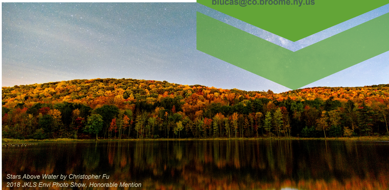
Stars Above Water by Christopher Fu 2018 JKLS Envi Photo Show, Honorable Mention

Topics include natural resource management, water resource protection, land use planning, sustainable development, clean energy and solid and hazardous waste management.