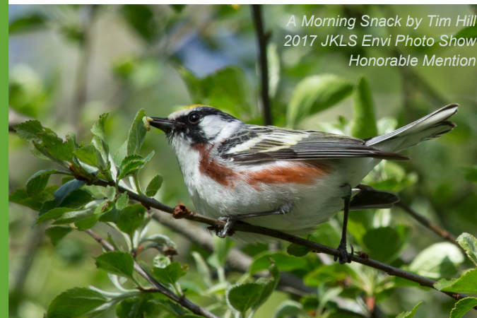
A Morning Snack by Tim Hill 2017 JKLS Envi Photo Show Honorable Mention

You can also be added to the EMC mailing list by emailing us at: blucas@co.broome.ny.us